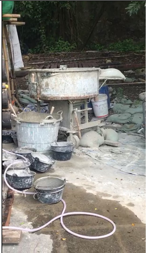
Video Screenshot 1 - Cement mixing carried out by the worker of Temple renovation work