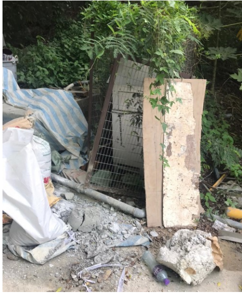
Photo 1 – Recent condition of the High Volume Sampler (HVS) at AM1, Tin Hau Temple. Debris and waste were scattered around the HVS (Taken on 29 Sep 2021)